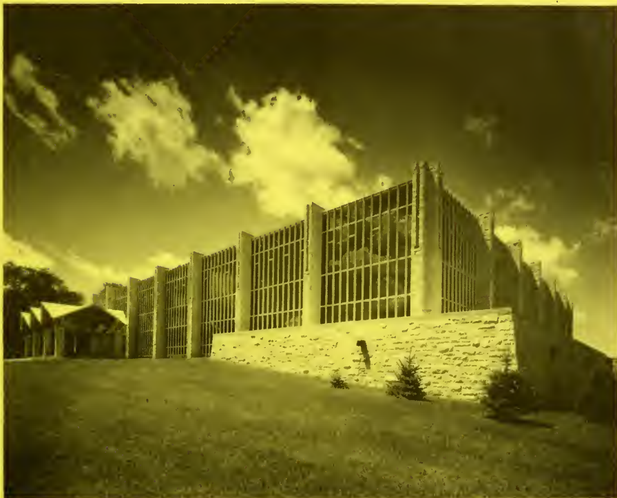
THE CENTER ST. OLAF COLLEGE NORTHFIELD, MINNESOTA

PILGRIM FELLOWSHIP—P.F. HERITAGE OF PILGRIM ENDEAVOR—H.O.P.E. June 25-28